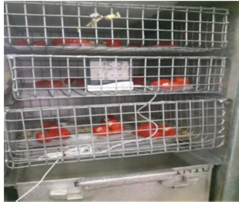
Tomato post-harvest system