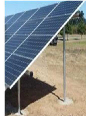
Solar Power Projects