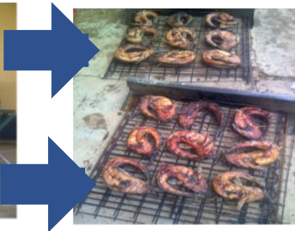
Semi-automated fish dryer, Bio- digester-bio- gas