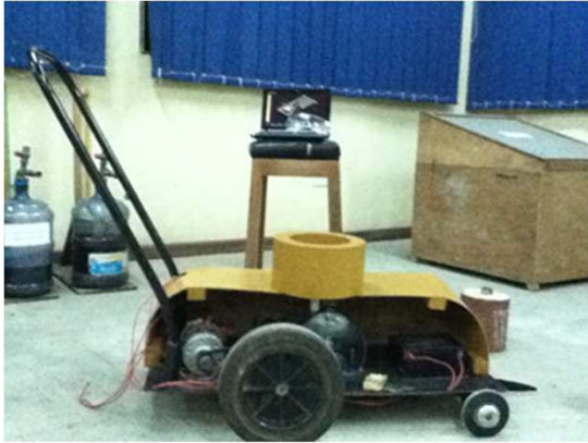
Three-way Seed Planter